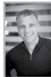
Eric Heiden, MD